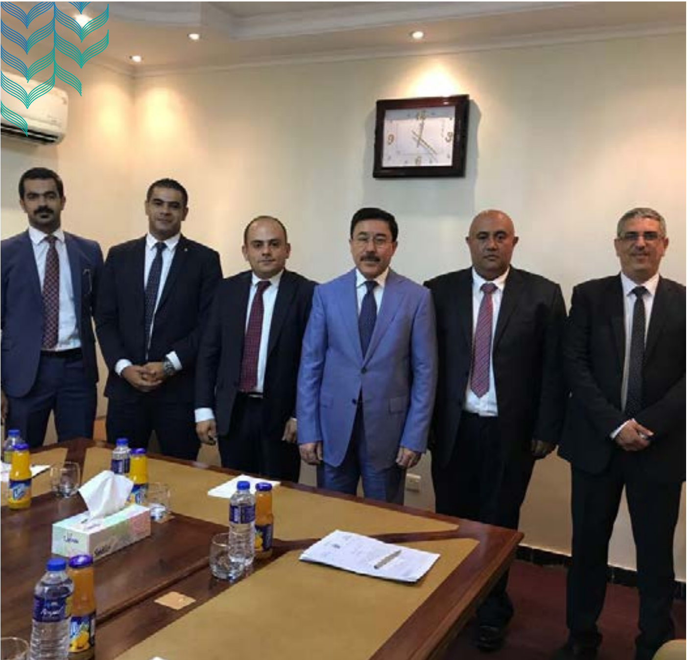
IASCA and Talal Abu-Ghazaleh Organization Discuss Means of Cooperation with the Central Bank of Iraq

YOUR GATE TO ACCOUNTING, AUDITING AND CODE OF ETHICS