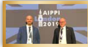
AGIP National Development Executive Director Elected to AIPPI Communication Committee Page 2