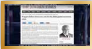
US-Based TruNews TV: The Truth Abu-Ghazaleh's Predictions on 2020 Economic Crisis Started to Emerge Page 1