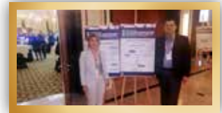
AGIP Participates in 2019 INTA TMAP Meeting Page 3