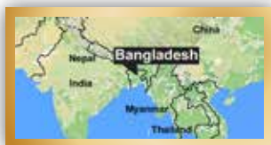
AGIP Launches its Services in Bangladesh