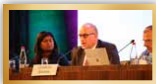
AGIP Participates in Internet Governance Forum 2018