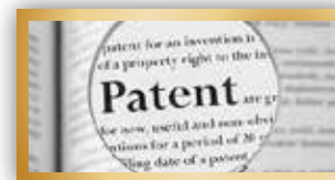
Jordan Issues New Resolution on Patent Renewal Fees