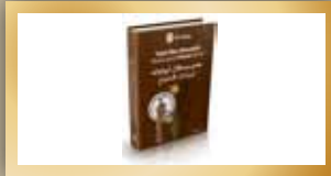
Tall Abu-Ghazaleh Dictionary of Patent Terms Published