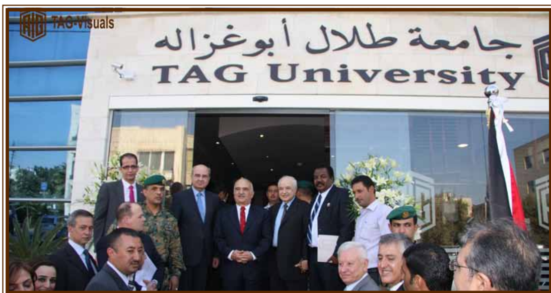
A photo from Talal Abu-Ghazaleh University inauguration ceremony- regional headquarters

We believe that it is our duty, at both the national and international levels, to provide services to the Arab region in accordance with the highest international standards. Although TAG-Org is an Arab institution, we are well recognized internationally and thus, can offer our region the same quality of services as provided by the best practicing organizations in the world.