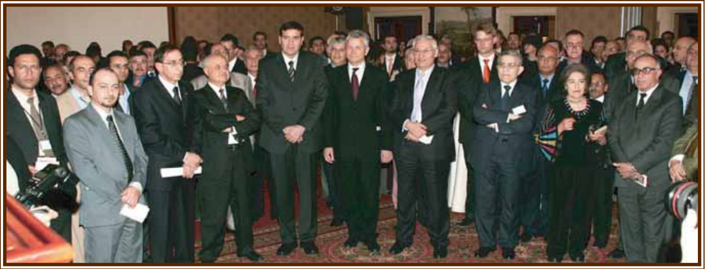
A photo from TAG-SB inauguration ceremony

influence our progress and development. We have a dedicated quality control department that requires each office to regularly undergo a peer review, carried out by other TAG-Org offices, to confirm that the method and quality of work are consistent with those of our network, worldwide.