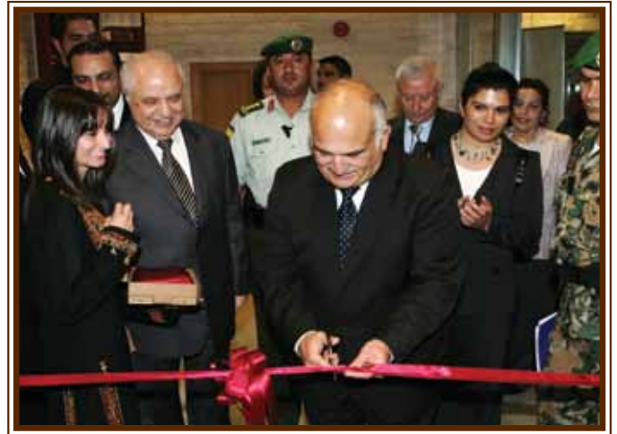
HRH Prince Hassan bin Talal Inaugurates Talal Abu-Ghazaleh Knowledge Society

TAG-Org offers, through its member firms, a composite range of professional services covering the following: Accounting; External Audit; Internal Audit; Corporate Governance; Taxation; Educational Consultancy; Economic and Strategic studies; Management Advisory Services; Professional and Technical Training; Technology Transfer Project Management; Real Estate Management; Investors and Business Advisory Services; Human Resources and Recruitment Services; E-Government; E-Commerce; E-Education; IT and Security Audit; Web mastering and Web Design; Professional Interpretation and Translation; Website Arabization: Domain Names Registration; ICT Strategic Planning; ERP Consulting Services; IT and Internet Skills Training and Examinations; Intellectual Property News Agency; IP Business and