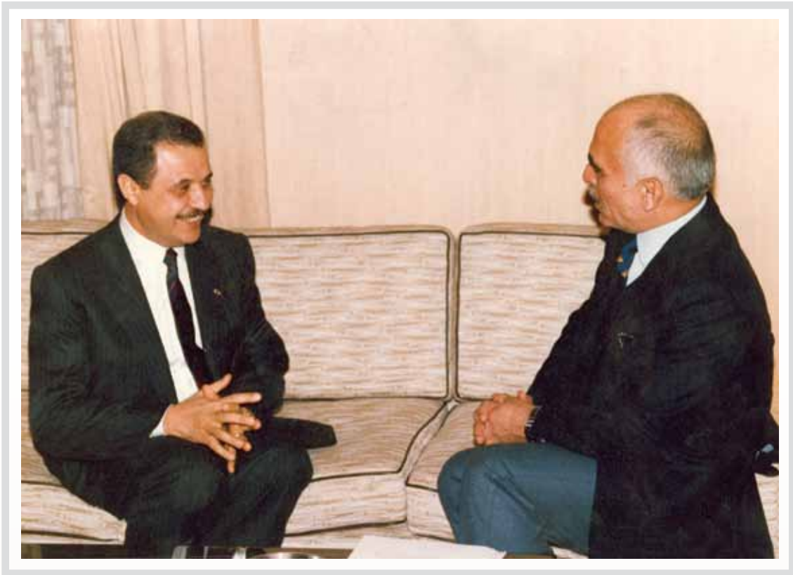
With his Majesty Late King Hussein Bin Talal

TAG-Org offices in Jordan have accomplished remarkable progress, overcoming any problems on the way. Among its offices in Amman is the regional office of Talal Abu-Ghazaleh Intellectual Property TAGIP (AGIP), which is the first of its kind: a pioneering company in the IP field in the world. Out of its social responsibility, AGIP has undertaken numerous initiatives focused on human capacity- building to serve the community and the economy.