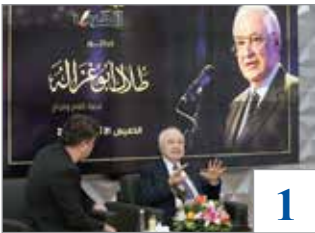
Abu-Ghazaleh Honored in Recognition of his Invaluable Contributions, Hosted by Sheikh Khalid bin Thani in Panel Discussion at Dar Al Arab