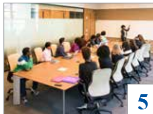
ASCA/Jordan Holds Various Training Courses in November