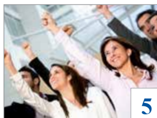
IACMA Examination Results of October 2019 Announced