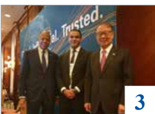
Abu-Ghazaleh: IASCA Participates in IFAC Council Meeting