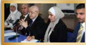
Abu-Ghazaleh Launches “Famous Arab Trademarks” Initiative