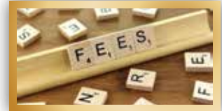
Increase in Official Fees for Patents and Designs in South Africa