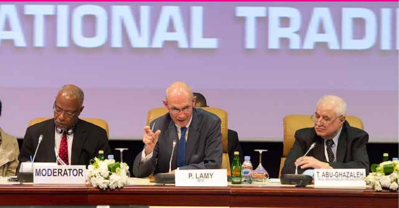
HE Dr. Talal Abu-Ghazaleh and Mr. Pascal Lamy, General Director of the World Trade Organization during the first WTO Panel of Experts on Defining the Future of Trade Meeting.

A new DG always brings a new beginning, fresh energy, and renewed hopes. It is my sincere hope that the issue of reform finds a home in the campaign and more importantly, with the new DG.