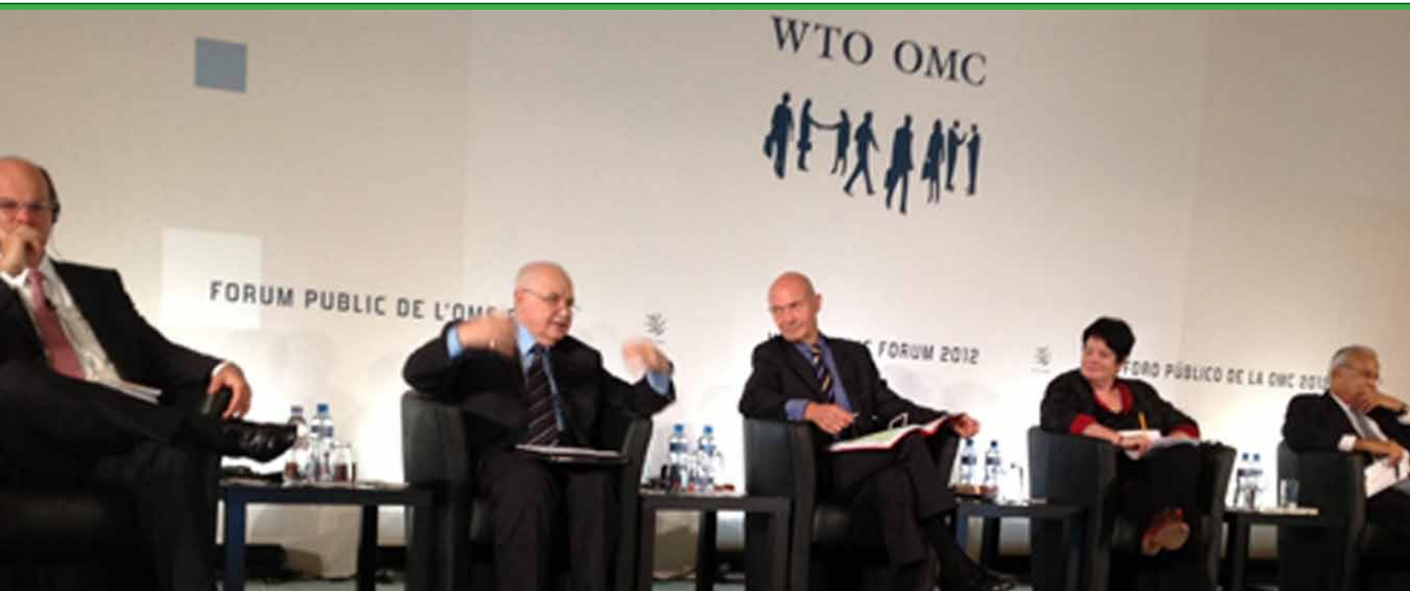
HE Dr. Talal Abu-Ghazaleh speaks during the World Trade Organization (WTO) Public Forum held in Geneva

European Trade Commissioner Seattle WTO Ministerial Conference December 2, 1999