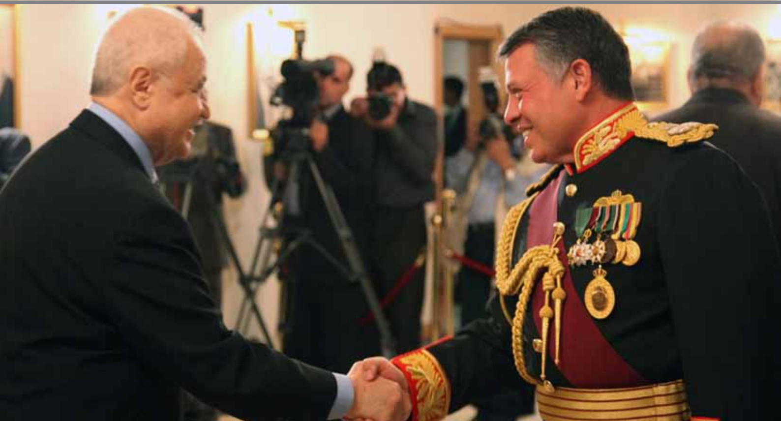
His Majesty King Abdullah II with HE Senator Talal Abu-Ghazaleh during the opening of the 16th Parliament's First Ordinary Session – November 28, 2010.

Talal Abu-Ghazaleh tag@tagi.com January, 2013